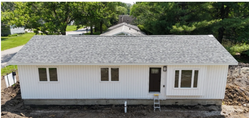
Home For Iowa house delivered to Fairfield in June 2025

For questions or help ordering, please contact Matt Naumann at (641) 814-8400 or matt.naumann@area15rpc.com