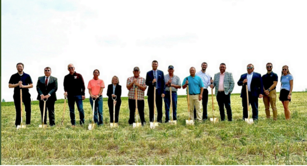
Photo: Groundbreaking Oskaloosa SE Connector Project, June, 2025

The largest investment project currently programmed in FY26-29 for the RPA 15 Region is the Oskaloosa NW bypass. This is a $70 million federal project that will connect Iowa Highway 163 to US Highway 63 along the Northwest section of Oskaloosa. The new facility will be a 3.6 mile long 2-lane undivided highway with 10-foot shoulders, turn lanes, and a climbing lane. A new interchange at IA163 and