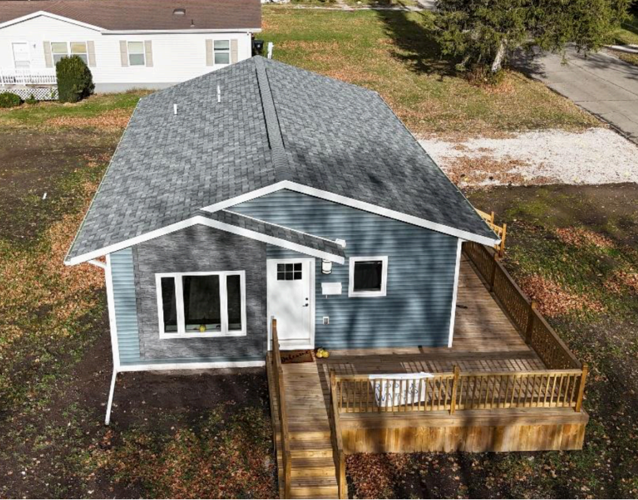
Homes for Iowa house in Fairfield