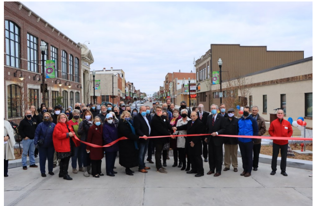
Ceremony Re-opening Main Street 10.29.2020

The streetscape project was funded, in part, by grants from the Iowa Economic Development Authority (IEDA) and the Iowa Department of Agriculture and Land Stewardship (IDALS), plus contributions from the City of Ottumwa, Ottumwa Water Works, and the Ottumwa Regional Legacy Foundation. The RPC helped secure an $800,000 Community Facilities Community Development Block Grant (CDBG) from IEDA and a $55,000 Urban Water Quality Initiative grant from IDALS. This project is expected to be fully complete this Spring of 2021.