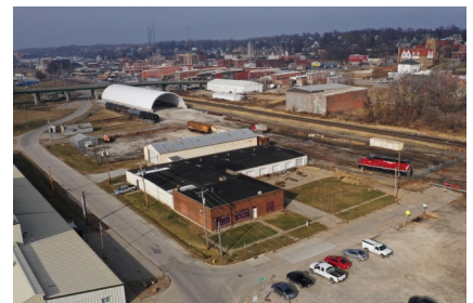
The Burlington Junction Railway [BJRY] transload facility in relation to downtown Ottumwa. Riverfront improvement plans are in progress to develop the vacant land between the railroad tracks and the river in the upper-left side of the frame.

RPC staff worked with OEDC to prepare an application to the RRLG to help fund a feasibility study for relocating the facility to an area more congruent with industrial use and better access for tractor-trailers. Area 15 will assist OEDC with the procurement of a consultant engineering firm, mapping and photographic services, and other general grant administration activities. The OEDC project was one of six applications presented to IDOT in June, and one of only four to be approved during this round of funding.