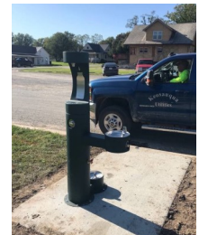
Water bottle filling station

As part of the project, the community also completed a Safe Routes to School assessment with assistance from Wellmark, which identified ways to make the community more pedestrian friendly. Keosauqua received funds for a second year to support their 5-2-1-0 strategies and planning has begun to utilize these funds—primarily around projects identified in the Safe Routes to School assessment.