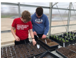
Students working in the greenhouse

After the successful application, Area 15 RPC staff worked with staff from the City of Keosauqua, Van Buren County Health Center Healthy Villages, and Wellmark Healthy Hometowns, as well as school, child care, and recreation representatives to develop a plan to promote 5-2-1-0 in the community.