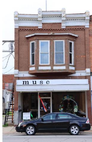
Oskaloosa—214 S. Market St.—Rendering of improvements