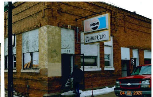
120 E. Main St., Fremont