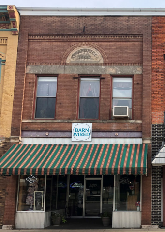
Sigourney—119 E. Marion—Rendering of improvements

The RPC is helping Sigourney with development of an application to IEDA's Community Development Block Grant (CDBG) Upper-story Housing Conversion (USH) fund to rehabilitate a vacant second-floor space into several apartments. Through a locally competitive process, the City selected a site in May and the early stages of design have begun. The CDBG-USH fund is in its second year as an allocated program at IEDA. The RPC is excited to see this program become a regular part of IEDA's housing fund after successfully administering IEDA's first pilot project in Ottumwa in 2018.