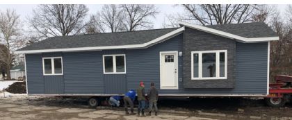
Homes for Iowa house delivered and set in Bloomfield in February 2021

Heritage Ventures of Iowa has teamed up with Area 15 Regional Planning Commission, the City of Bloomfield, Davis County Development Corporation and Homes for Iowa to deliver the first home in Southeast Iowa as part of the Homes for Iowa Campaign. The home was placed on its foundation located on Rebecca Drive in Bloomfield on Thursday, February 25, 2021.